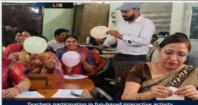
Teachers participating in fun-based interactive activity